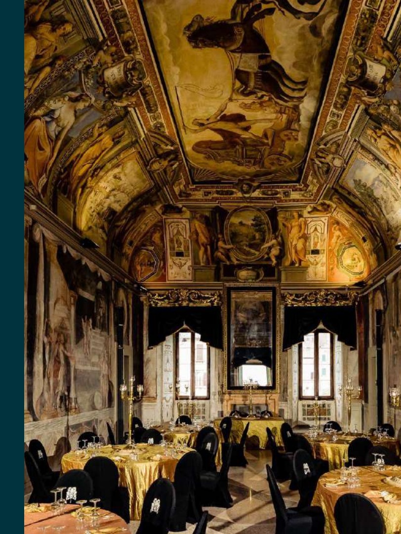
Team Castello Brancaccio Presented by Ashford Group

For a detailed proposal we advise for you to schedule a personal appointment with our team. During your meeting with us, we will take you on a guided tour of the castle & grounds, as well as, discuss your wishes for the most detailed proposal possible. We look forward to welcoming at Castello Brancaccio & our team is happy to assist you with any questions that you may have.